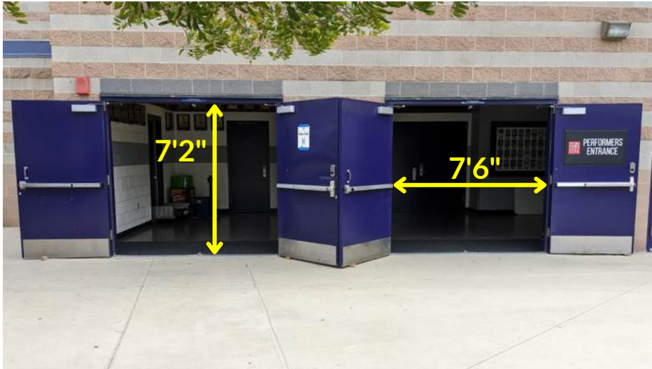
Prestage Hallway Entry