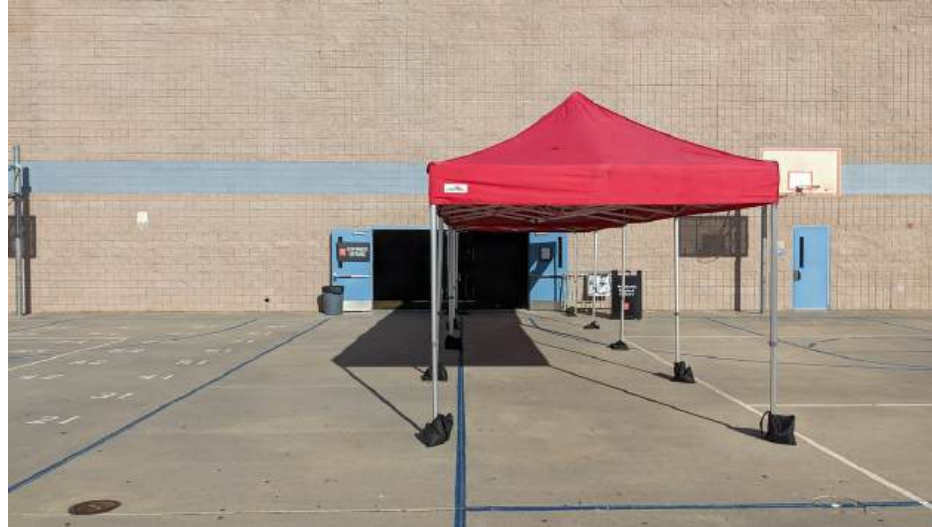
Entry Doors with Canopies