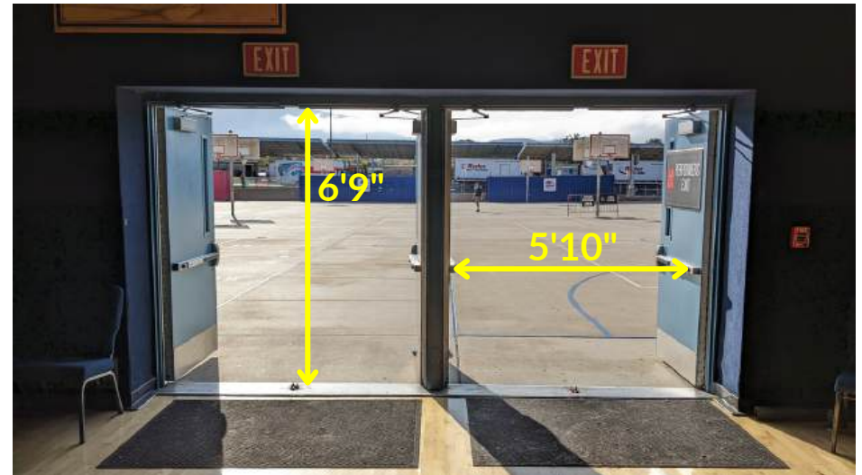
Exit Doors (2 double doors)